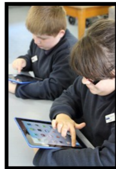
Local photos and captions here

GROUPS : our families meet, work and celebrate together.